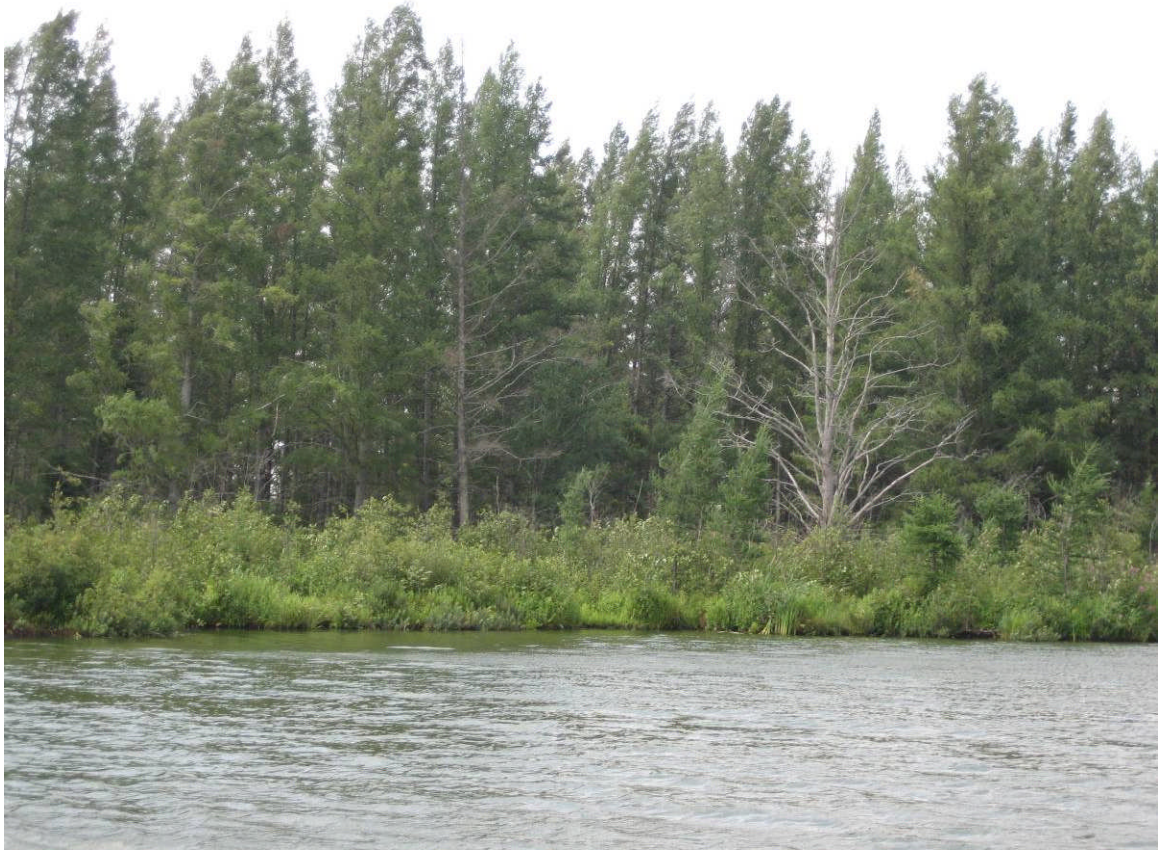
A thirty acre large peat based floating island in northern Wisconsin. This eighty year old island is 19 feet thick within thirty feet of its edge, supports tens of thousands of trees, and in the process has naturally biosequestered an estimated

The “wetland effect” is manifested by a high ratio of surface area to water. Combined with circulation, this is a recipe for healthy water. A deep fish pond with a smooth pond liner on its bottom, minimizes surface area relative to water volume. This is a recipe for unhealthy water. Surface area is a primary limiting variable for microbes. Where phytoplankton can function in open water, microbes prosper on surface area. The microbes that represent the key nutrient uptake element of wetlands function as “first responders”. Microbial populations, which can double in minutes, even faster than algae, set the stage for wetlands to contend with the nutrient “surges” so prevalent around agricultural. When we combine a high ratio of surface area with circulation, as in the wetland effect, microbes out-compete phytoplankton and minimize the risk of an algae monoculture.