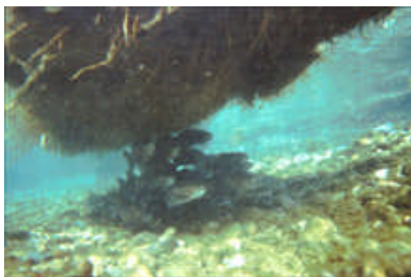
Rainbow Trout sheltering from osprey predation under a manmade floating island.

Another advantage of deep water settings for floating treatment wetlands is that the thermal mass offered by a large body of water provides longer exposure to median temperature ranges, and extends the seasonal efficacy of microbes that are responsible for the largest fraction of nitrogen, ammonium and nitrate uptake. Plants are second to microbes in direct nitrate uptake, but as their roots contribute to an expanded surface area, which is a limiting variable for microbes, they can play a dual, critical role in ecosystem health. Plants are also favorably impacted by the extended growing season afforded by the thermal mass of large bodies of water.